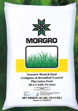
Summer WEED & FEED 28-2-2