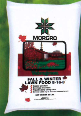
Velvagreen FALL & WINTER FERTILIZER 8-16-8