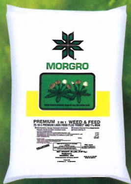
Premium 2 in 1 WEED & FEED 25-10-5 Plus Iron