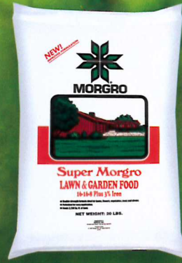
Super MORGRO LAWN & GARDEN FERTILIZER 16-16-8 Plus Iron